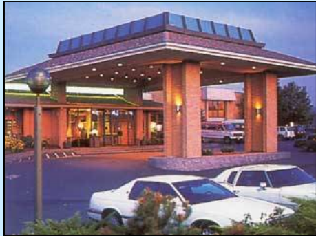
1100 North Sullivan Road, Spokane Valley, WA 99037

The official hotel for the Miyagi Chojun Festival is the Mirabeau Park Hotel & Convention Center, it is also the site for all training events and the Pan-American Karate Championships. We have secured a special reduced rate for attendees and their families. Nestled in the scenic Spokane Valley, The Mirabeau Park Hotel & Convention Center is located within an easy drive of 76 lakes and 49 golf courses. Just off Interstate 90 at Exit 291B, they are only minutes away from downtown Spokane, Spokane Valley Mall, Spokane Arena, Splash Down water park, The Mall at Riverpark Square, Riverfront Park, Post Falls & Coeur d'