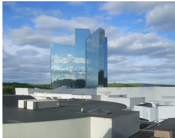
Mohegan Sun Casino